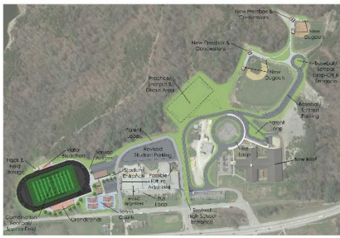
For More Information Visit: www.estill.kyschools.us/Content/Nickel